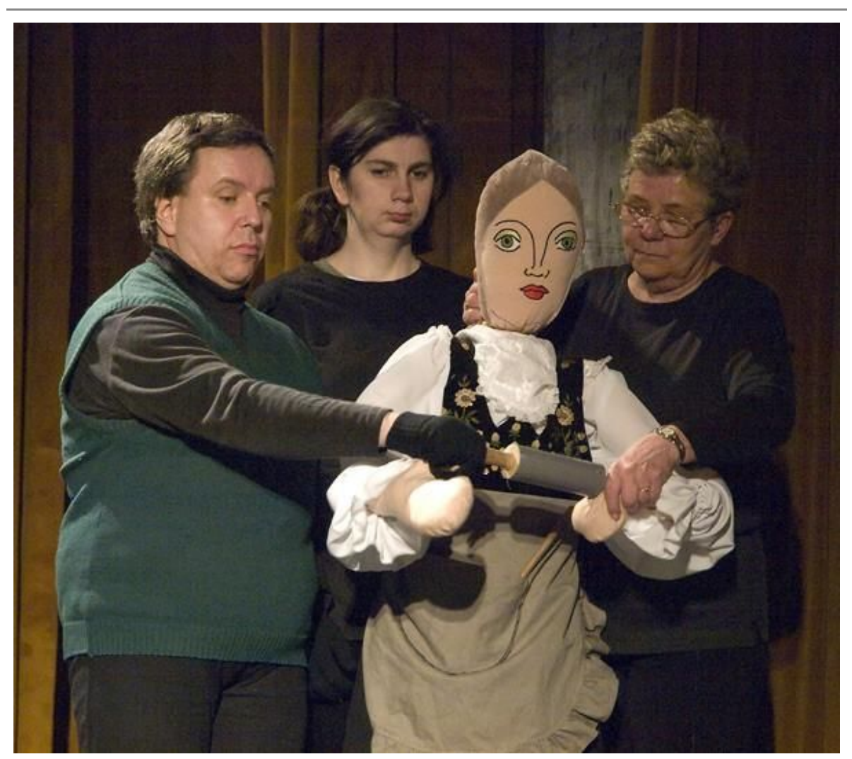
© The Bielsko Artistic Association Grodzki Theatre