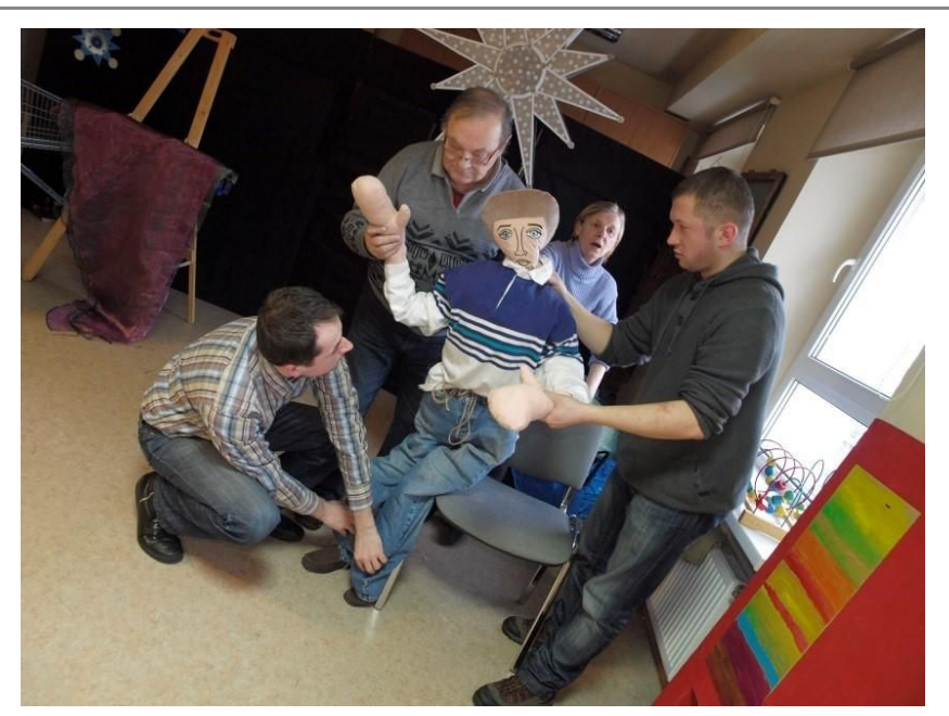
© The Bielsko Artistic Association Grodzki Theatre