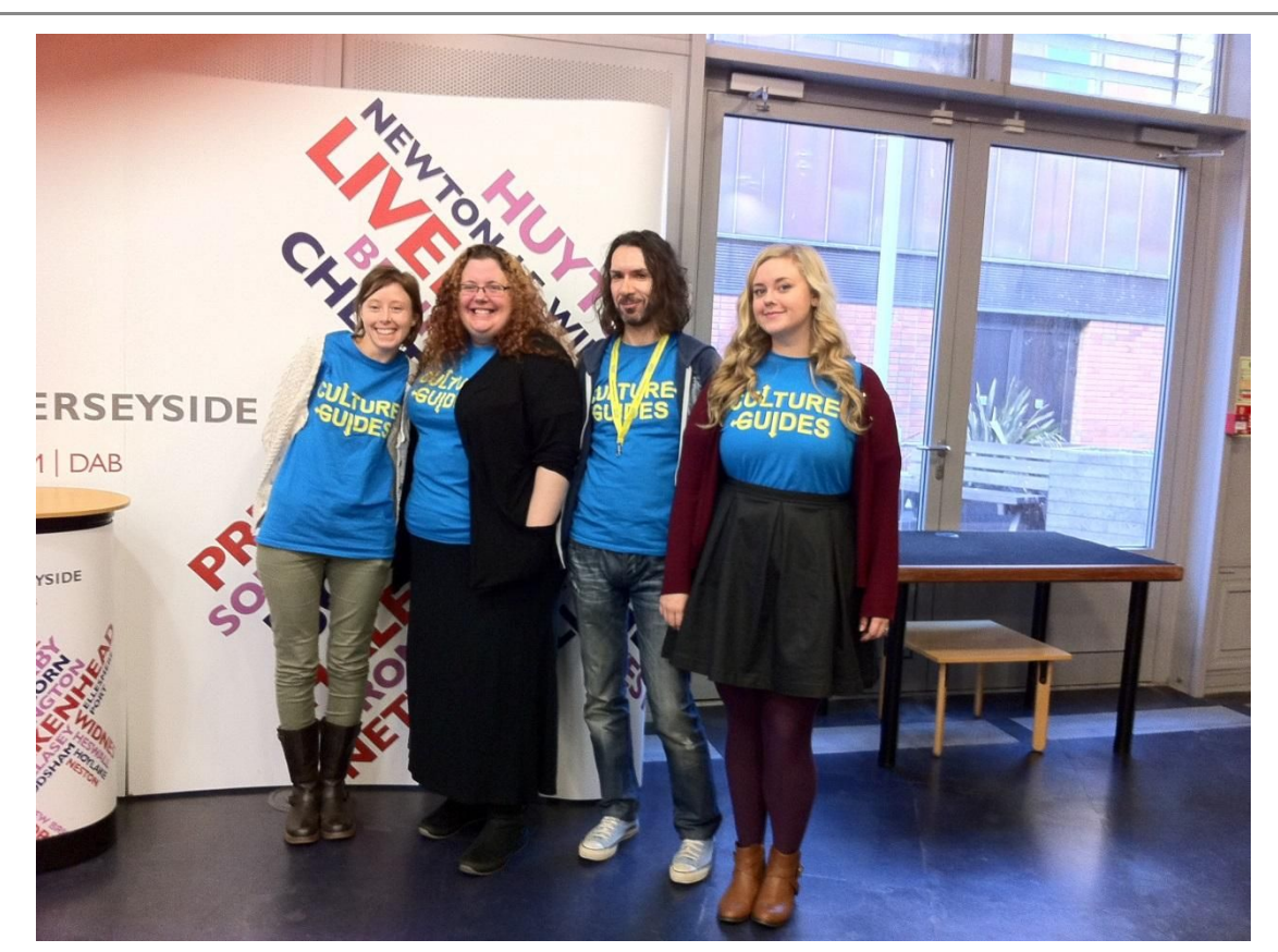
The elementary school reform

At the same time, a primary school reform came into force - the so-called "Open School".