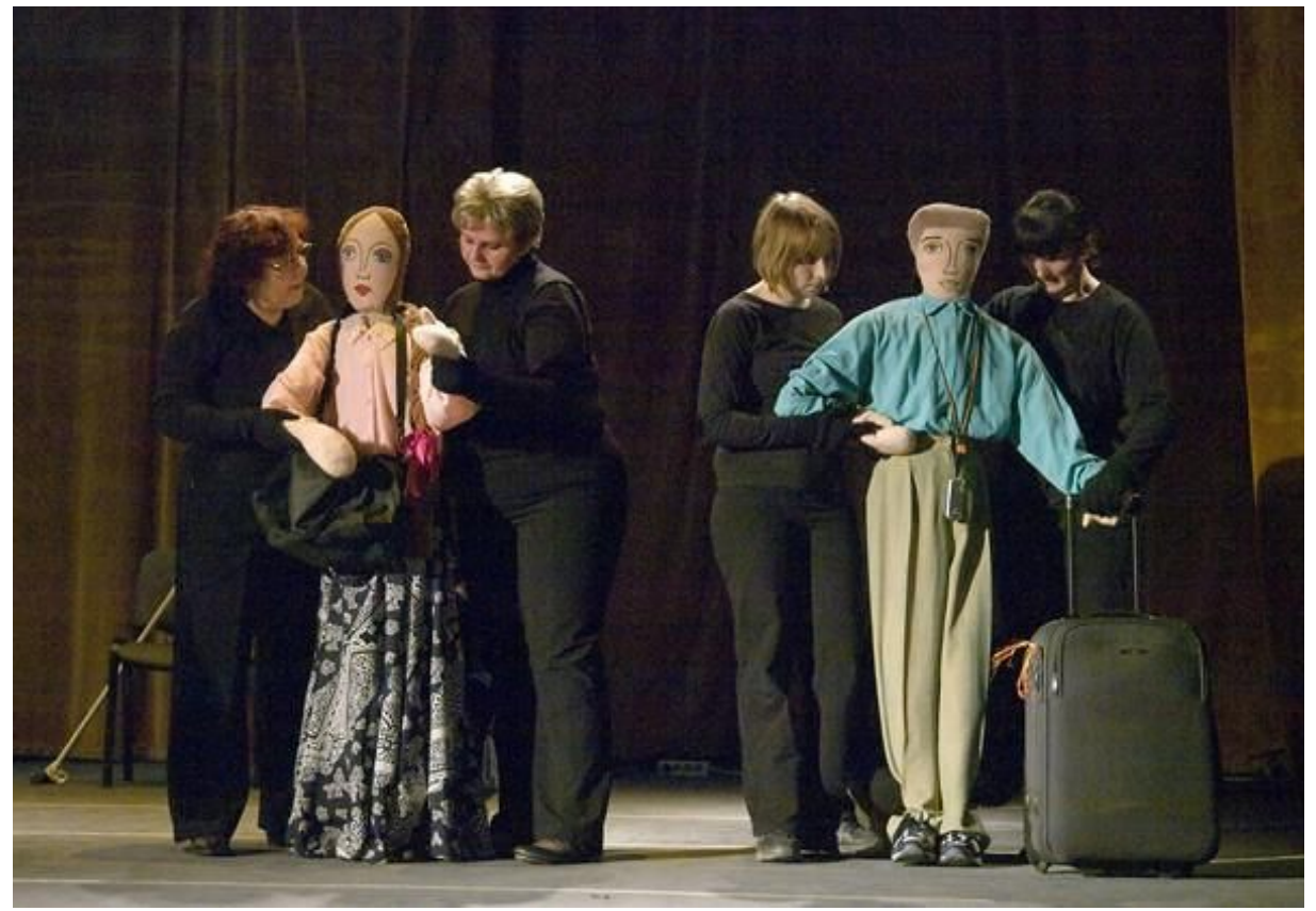
© The Bielsko Artistic Association Grodzki Theatre

Since its founding, in 1999, the Bielsko Artistic Association Grodzki Theatre runs activities activating persons with disabilities and those endangered with social exclusion and discrimination, applying theatre-based work methods. The Association developed some own methodologies of working with those groups, which are also shared internationally. At the same time, the Grodzki Theatre team constantly searches for new solutions and inspirations. The "Theatre joins generations" project is one of such initiatives.