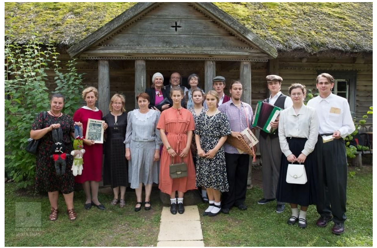
Time travelers at the Lithuanian Open Air Museum, August 2014