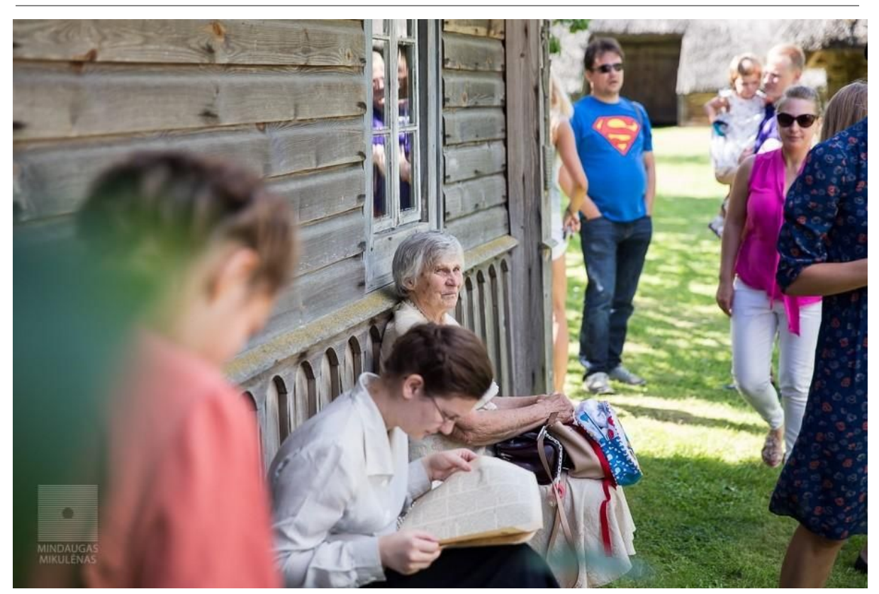
Inter-generational time travel activity at the Lithuanian Open Air Museum, August 2014