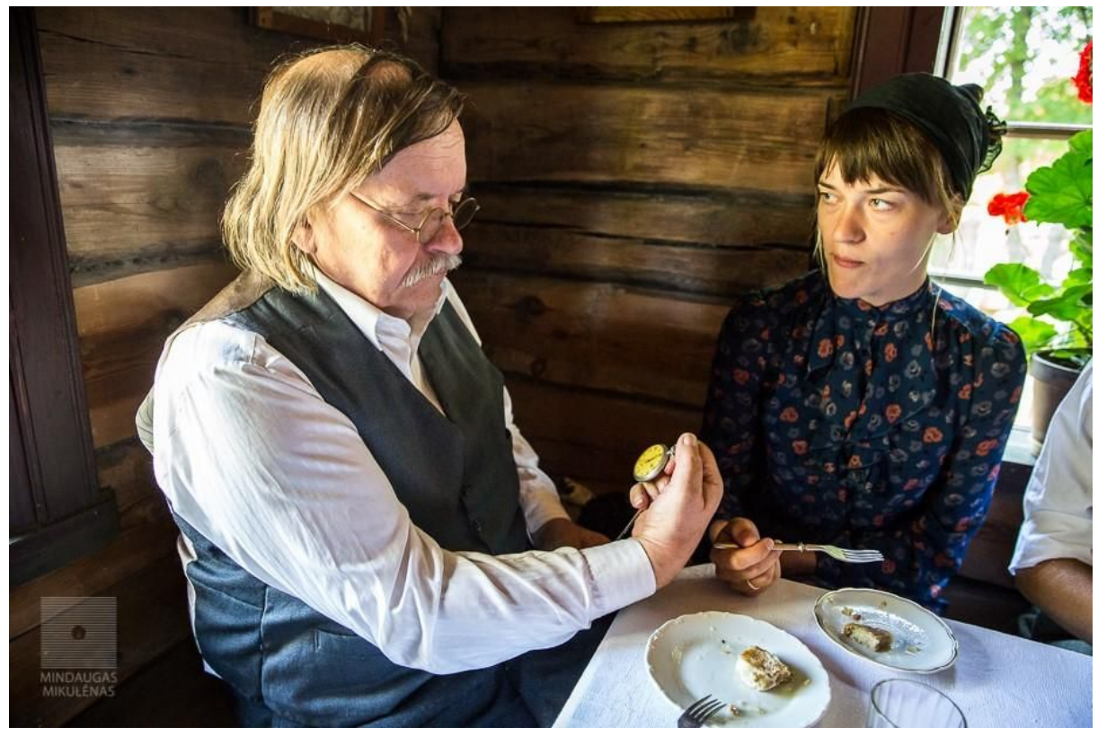
The time travelling session starts, Aug 2014

The next during the time travelling all participants used specific narratives, artefacts, and activities to create "alive pictures", like a kaleidoscope. The topic chosen should also allow for nowadays problems and questions, for example questions about emigration, business depression, patriotism, fatherland defence in the 30's -40's of 20 century, etc. Here young people also acted for the elder with dancing, acting etc. The end-users were in this case the museums visitors of different age this day (around 3000) including elderly families with more generations.