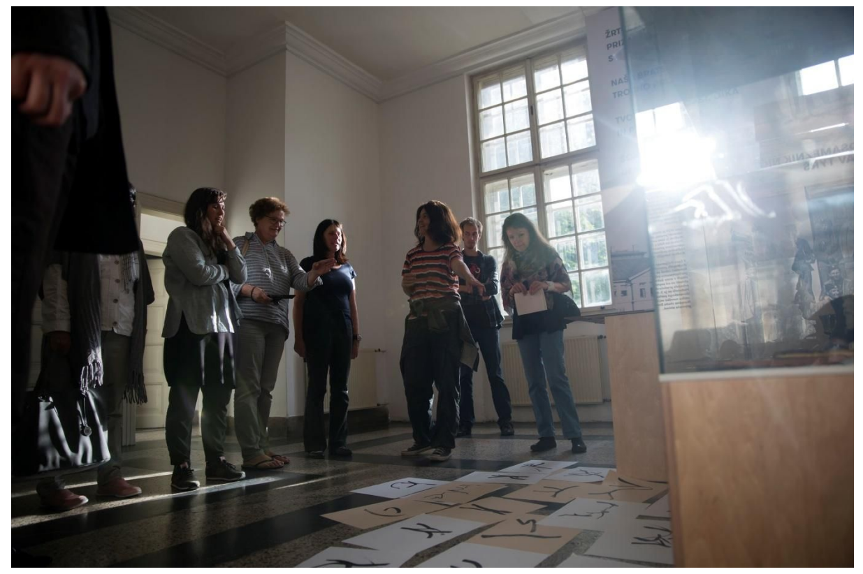
Dance moments, Summer Dance School 2018, photo: Nuša Ofentavšek

Majority of the participants are younger than 20, that correlates to the period were young dancers choose between professional dance carriers or perusing other vocational options. There are only few adult amateur contemporary dance groups in Slovenia. On the other side, the trends show that the majority of the participants of the fine arts workshops are middle aged or elderly.