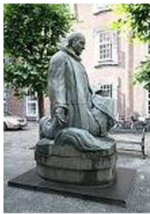
Statue of Grundtvig