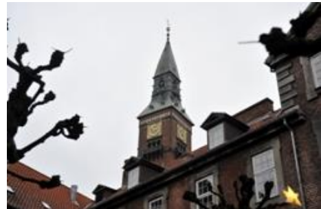
City Hall tower seen from Vartov's courtyard

Vartov is an historic and beautiful building with Copenhagen City Hall as its closest neighbour.