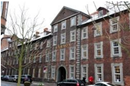
Entrance to Vartov