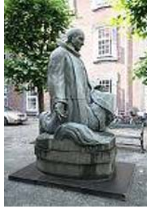
Statue of Grundtvig