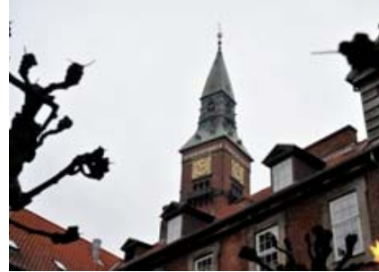
City Hall tower seen from Vartov's courtyard

Vartov is an historic and beautiful building with Copenhagen City Hall as its closest neighbour. Vartov is known to have had the famous Danish poet, priest and adult educator N.F.S. Grundtvig as pastor in 33 years from 1839 to 1872 at the Vartov church which is part of the building complex.