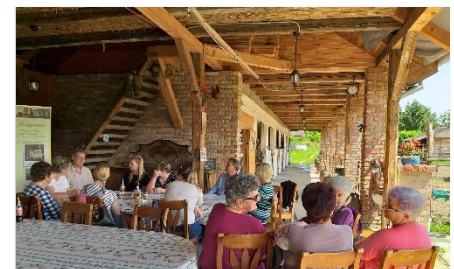
Free time at Tata Folk High School