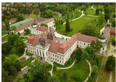
Royal palace of Godollo, from above