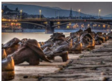
Memorial holocaust at Danube river. Shoes represents victims left.

Evening: Common dinner nearby the hotel.