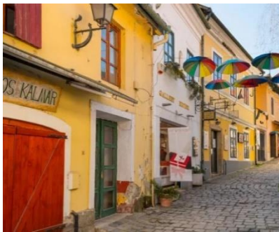
Street in Szentendre city