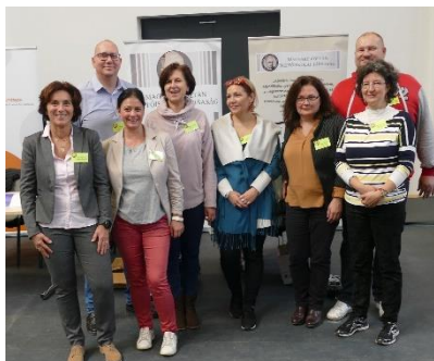
The team from Tata Folk High School