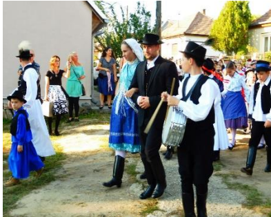
Harvest grape parade - organized each year in Kistarcsa.