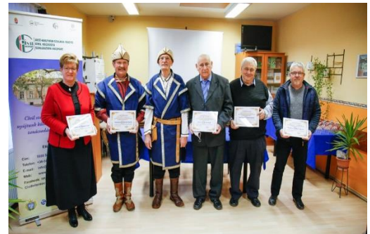
Rewarding excellence in civil society initiatives, 2022.02.03