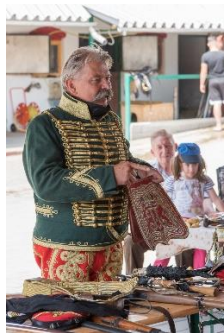
Traditional summer camp