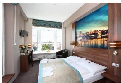
Medos hotel, double room