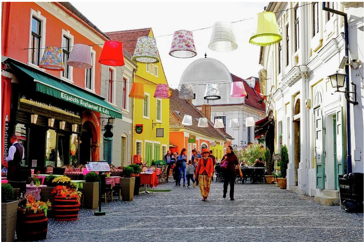
Pedestrian street in Szentendre

5-day study visit to Hungary, Saturday - Wednesday, 25th – 29th of June 2022