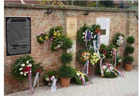
The memorial wall of a former detention working camp in Kistarcsa, created by host.