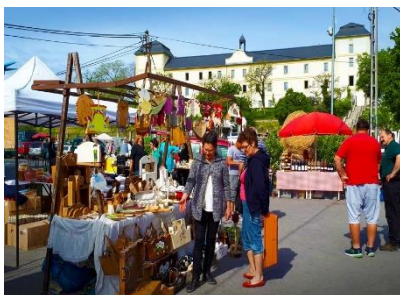
The traditional open air marketplace in Veresegyház