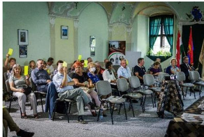
Learning session at Tata Folk High School