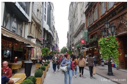
Váci Utcat, the main pedestrian street in Budapest