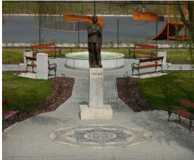
Mosaic in Kistarcsa, prepared in a Grundtvig supported course.

19:30 Festive Dinner in Budapest at Callas House (7 min walk from the hotel)