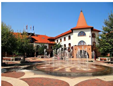
Veresegyháza main square

19:40 Departure from Airport – arrival at Copenhagen Airport (CPH) at 21:35