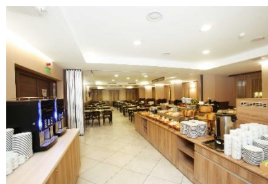
Medos Hotel, breakfast room