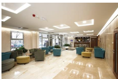
Medos Hotel, the reception