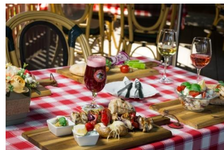
Haldorádó Restaurant at Ivacsi lake at Veresegyház