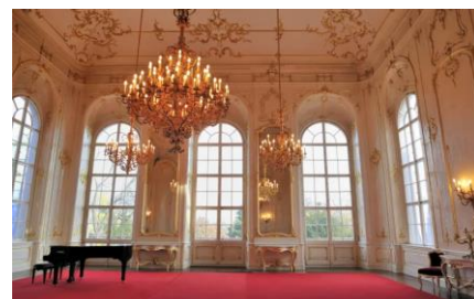
Sala Piano, Godollo