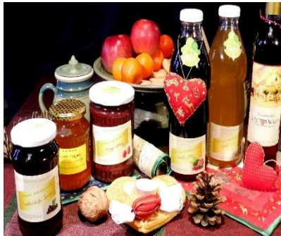
Local food of Dunakanyar (Danube blend) and Szentendre