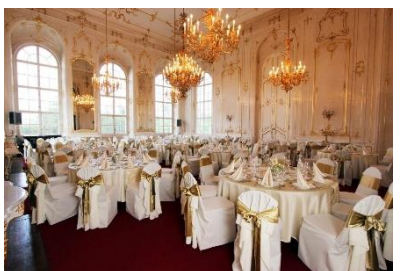
Royal palace of Godollo, dining room