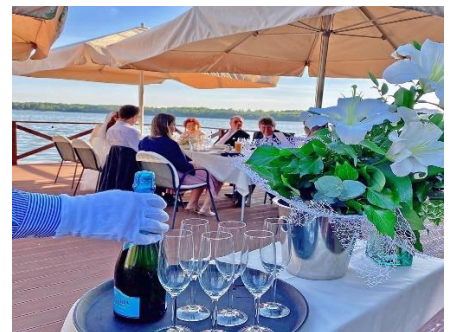
Grill Restaurant Tata