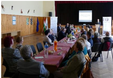
Official meeting at Tata Folk High School