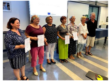
Certification at FHSASB