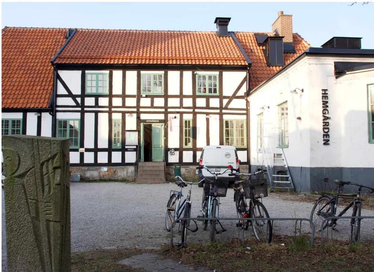
Lunds Ungdoms- och Hemgård

3-day study visit to Lund and Malmö, 6 th – 8 th of December 2023